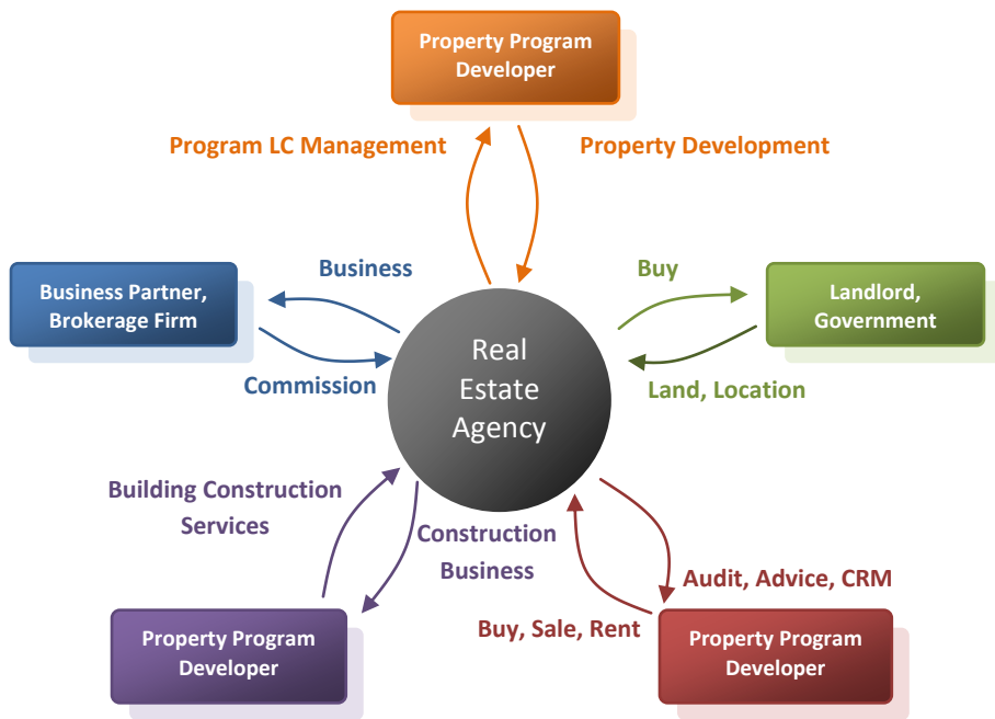
Fig: Real Estate Agency Context and Flow

The scope of this application is illustrated below explaining the key focus areas for this solution.